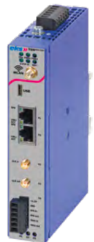
Device without antenna

Optional software modules can be used to extend the range of functions individually. These include TSN endpoint, traffic generator and various protocol converters, e.g. from TSN to Profinet or Modbus-TCP.